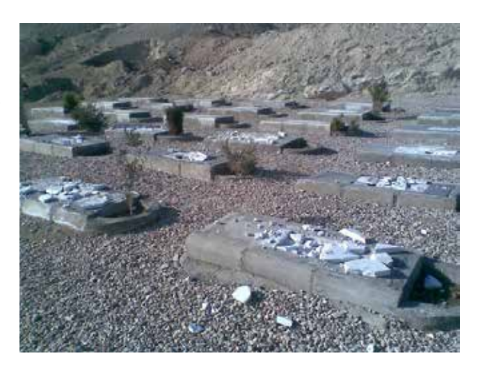
The Semnan Bahá'í cemetery after it was vandalized in February 2009. Approximately 50 gravestones were demolished and the mortuary building was set on fire.

In mid-August 2009, a section of the Bahá'í cemetery of Semnan where prayers are recited for the deceased was destroyed by assailants using a front end