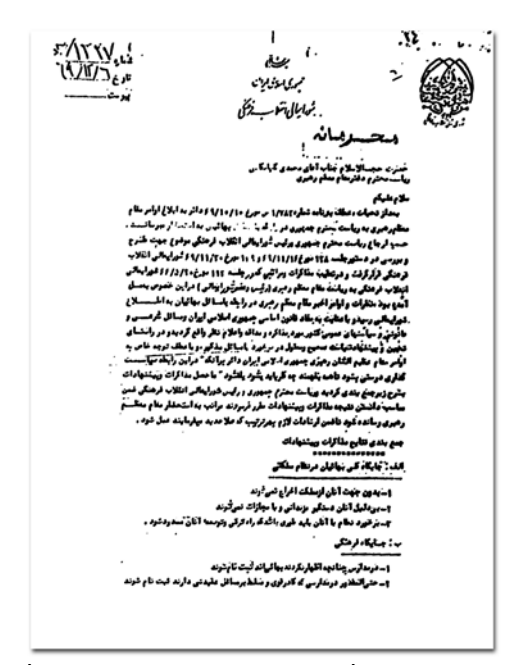
The 1991 secret memorandum on the "Bahá'í Question." The full document is reproduced on page 34.

The memorandum came to light in 1993, when it was released in connection with a United Nations report on Iran's human rights.