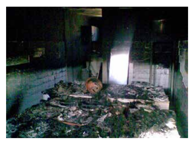
Interior view of a mortuary building used to prepare bodies in the Semnan Bahá'í cemetery, after being attacked by arsonists in February 2009.

Within weeks of those rallies, on 15 December 2008, the homes of some 20 Bahá'ís were raided by authorities at dawn. Bahá'í materials, computers, and mobile telephones were seized. Nine Bahá'ís whose homes were raided were arrested, one at the time of the raids and eight more later,