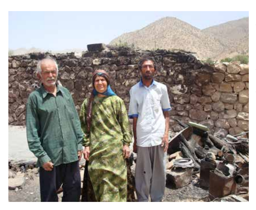
On 10 June 2008, the Mousavi family of Fars province narrowly escaped injury when an arsonist caused a fire that destroyed a hut near where the family was sleeping.